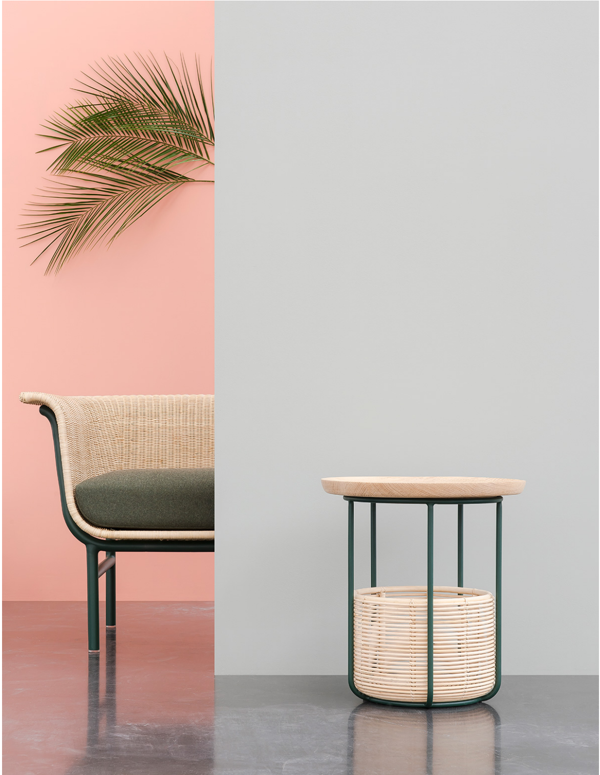
5. Alain Gilles's Wicked sofa and Basket table for Vincent Sheppard on view at Interieur Biennale