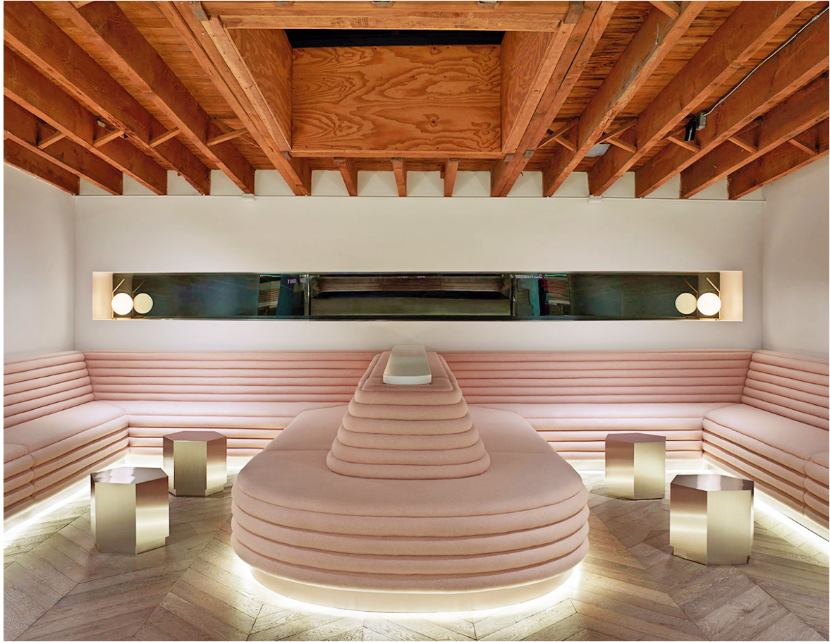
2. Rafael de Cárdenas and Jen Brill's design for 45 Grand, a fitness studio for Nike Women