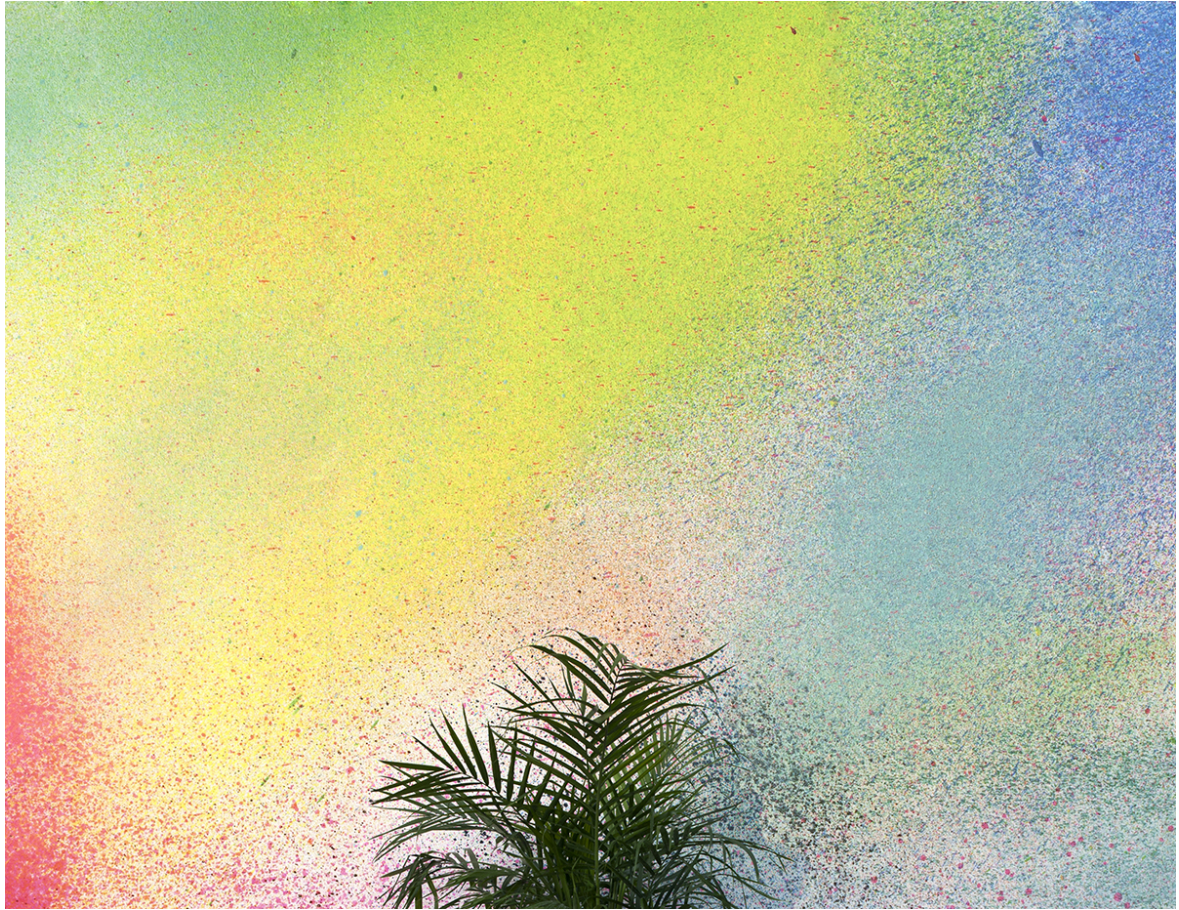
6. Flat Vernacular's amazing Heavens wallpaper