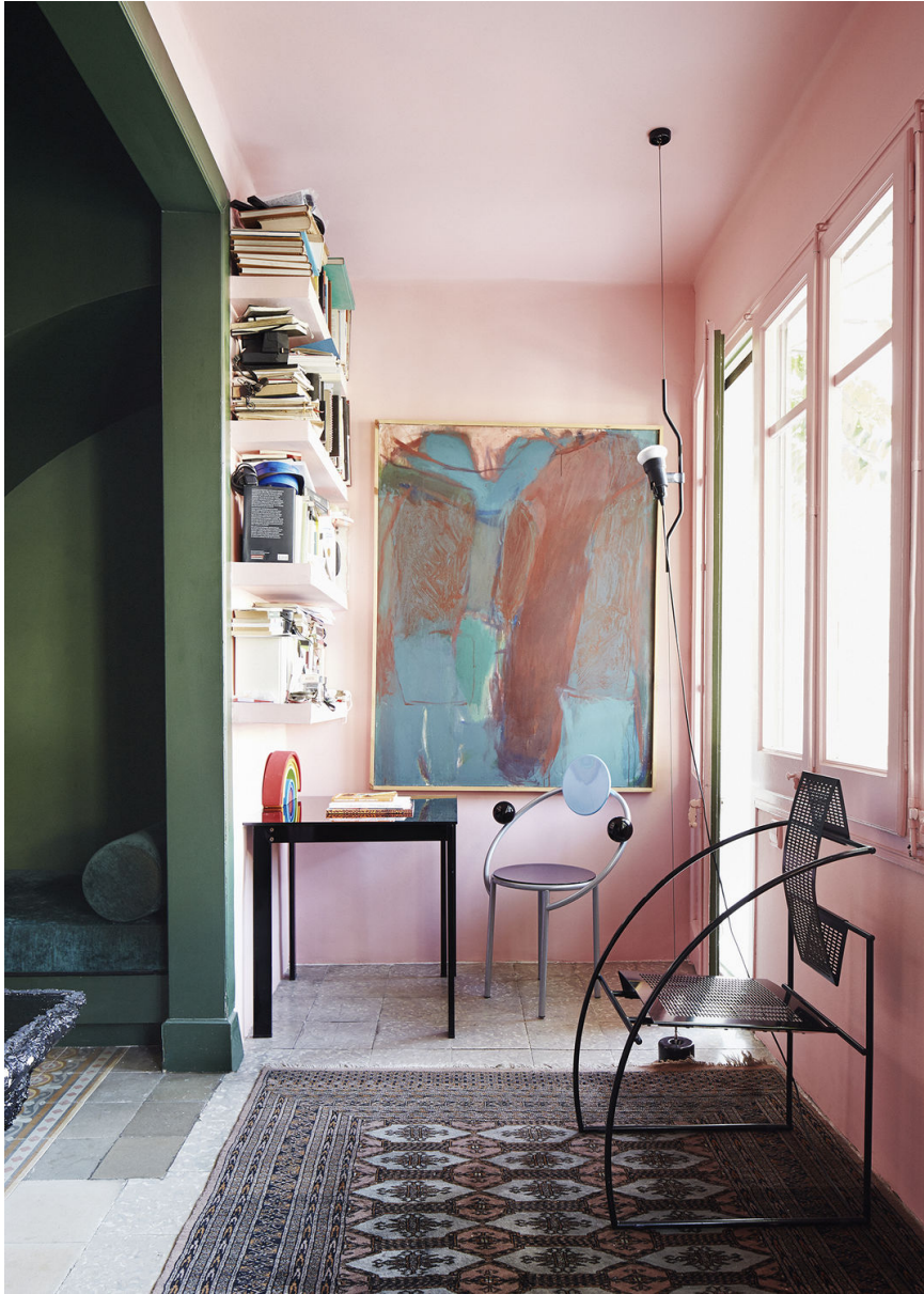
1. Guillermo Santoma's (finally-furnished!) Barcelona home