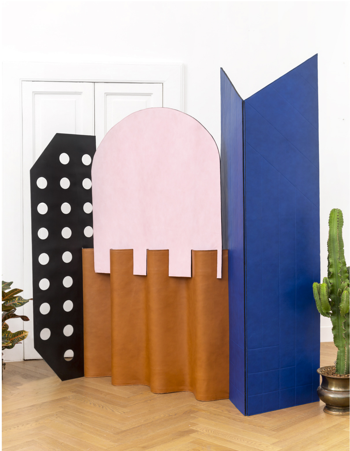
10. Lucia Massari's leather room divider