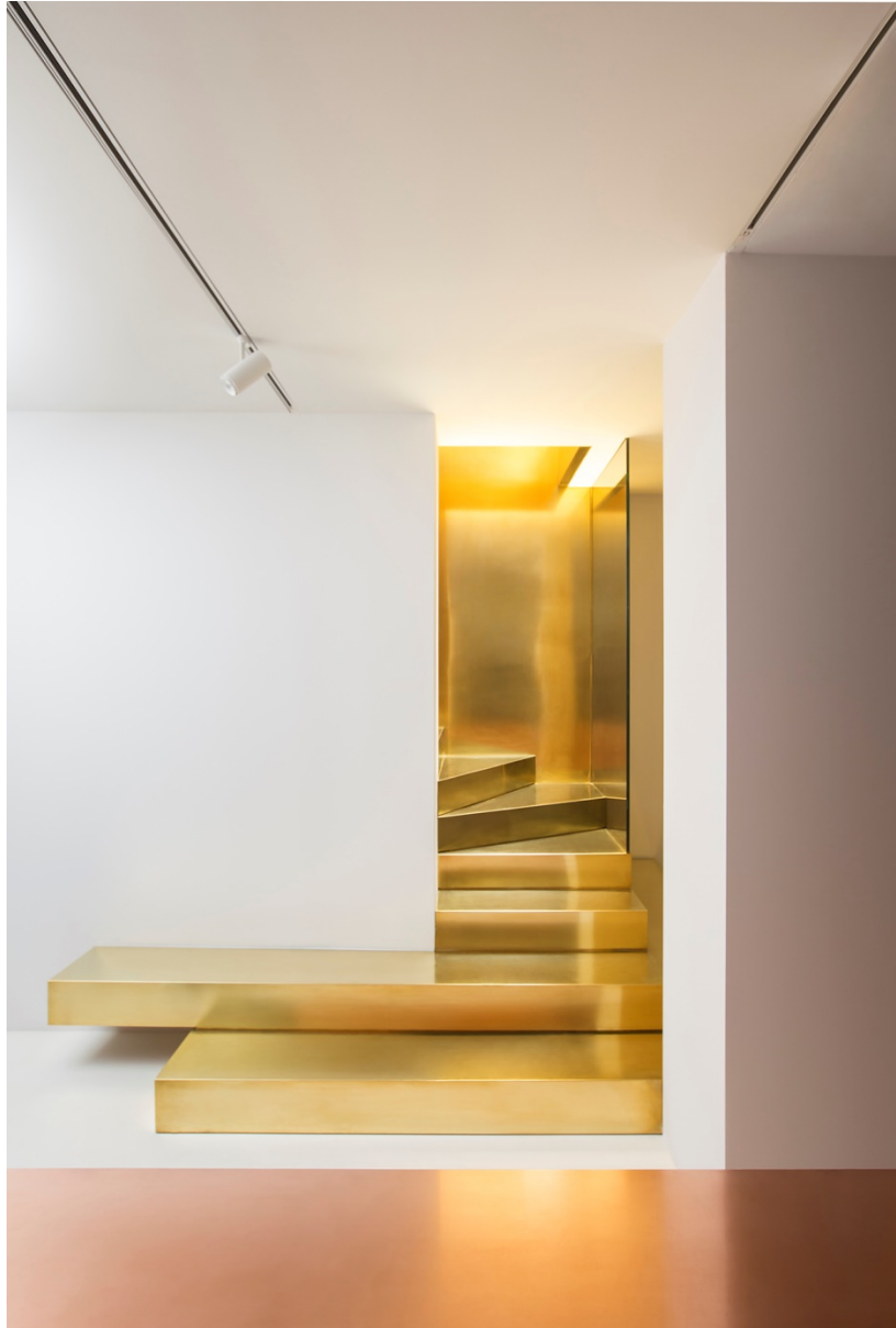
3. In Milan, the Golran flagship's golden staircase