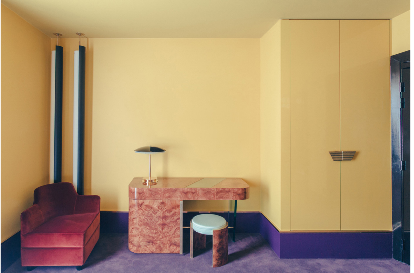
8. Dimore Studio's Hotel Saint Marc in Paris